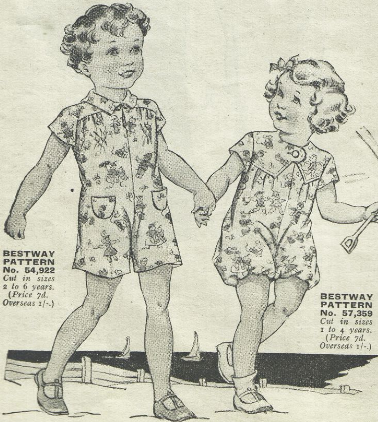
BESTWAY PATTERN No. 54,922 Cut in sizes 2 to 6 years. (Price 7d. Overseas 1/-.)