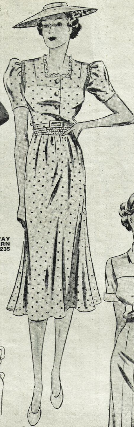
BESTWAY PATTERN No. 11,548