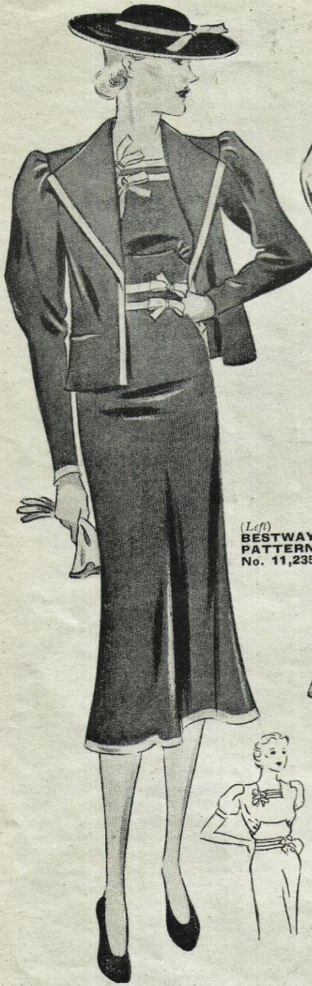
(Left) BESTWAY PATTERN No. 11,235

All orders by post must be sent to: "Woman's Pictorial," Paper Pattern Dept. 21, Whitefriars Street, London, E.C.4. Paper patterns of the numbered designs on this and the preceding page can be obtained in 32, 34, 36, 38 and 40-inch bust sizes, price 1/- each, post free, or overseas 1/9, unless otherwise stated. South African readers should write to: "Woman's Pictorial" Pattern Dept., c/o South African "Woman's Weekly," P.O. Box 950, Durban.