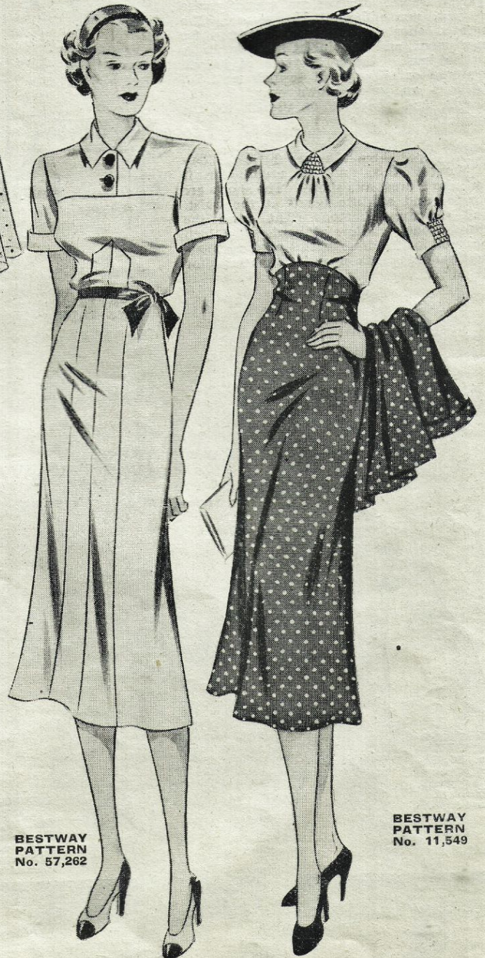
BESTWAY PATTERN No. 57,262